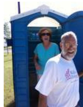
Hmmm. What's your caption?