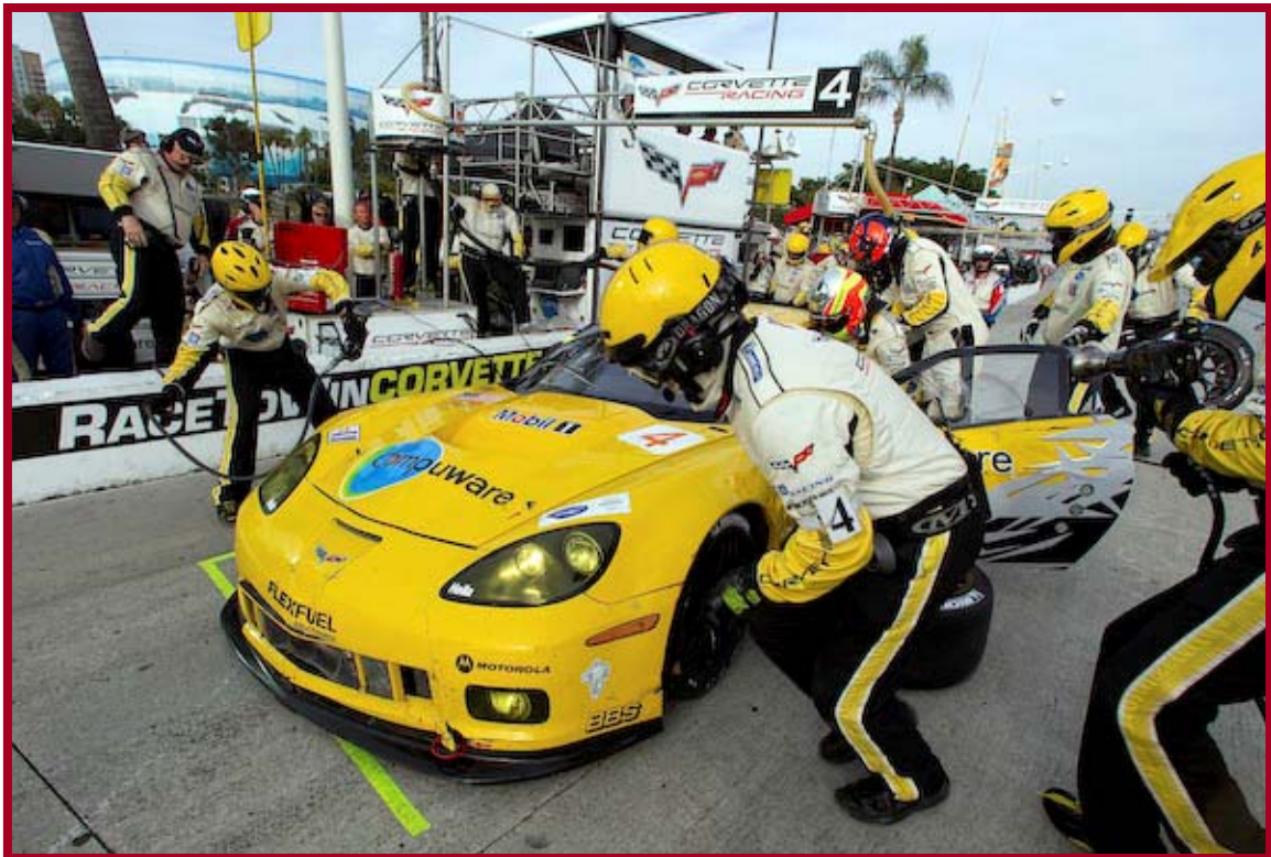
The Corvette Race Team in action at Long Beach

OFFICIAL PUBLICATION CORVETTE CLUB OF MICHIGAN