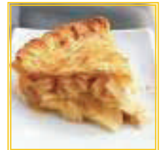
Seen @ Erwin Orchards !!