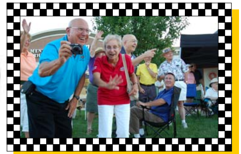
Seen @ Woodward !!